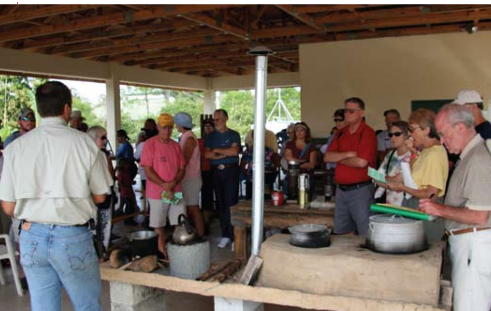
Center to Bottom: Farm Day attendees taste fresh sugarcane juice; Workshop attendees experience the Appropriate Technology Center and learn about improved cookstoves and alternative fuels.